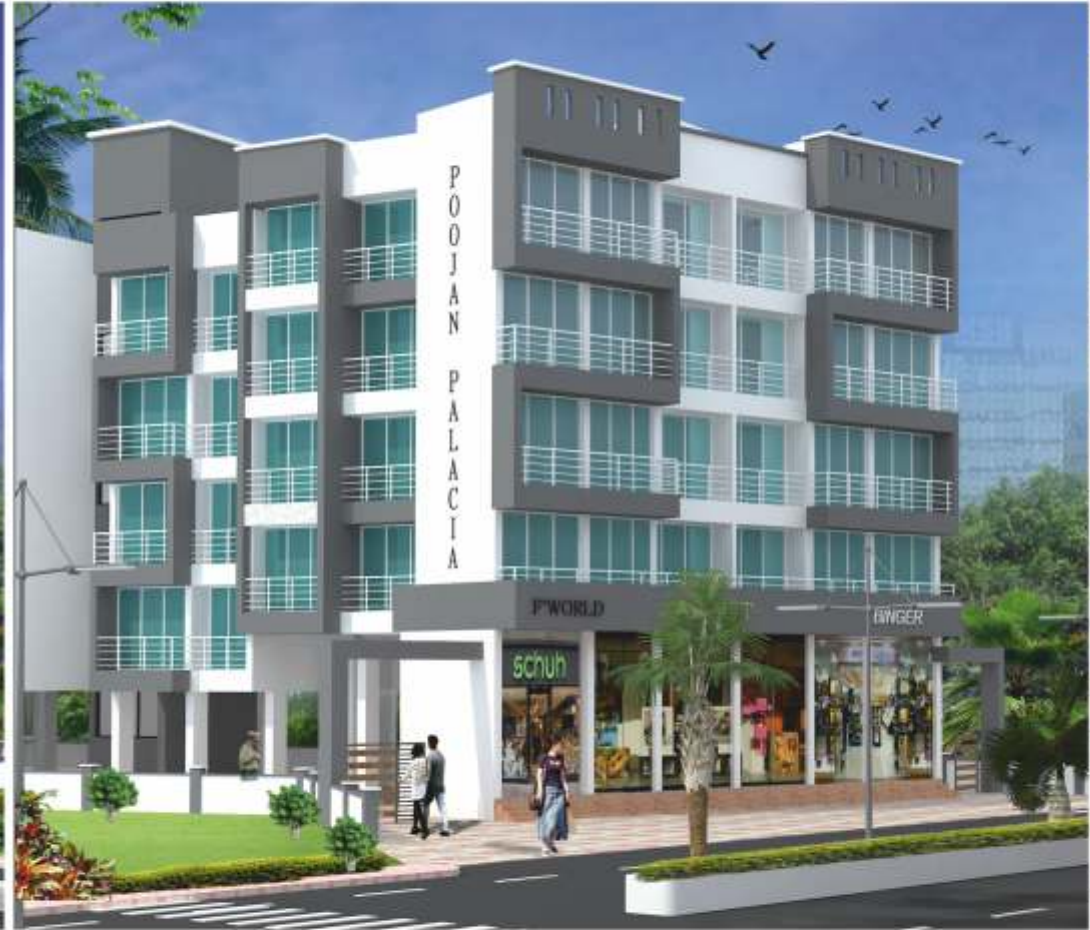
WING - B