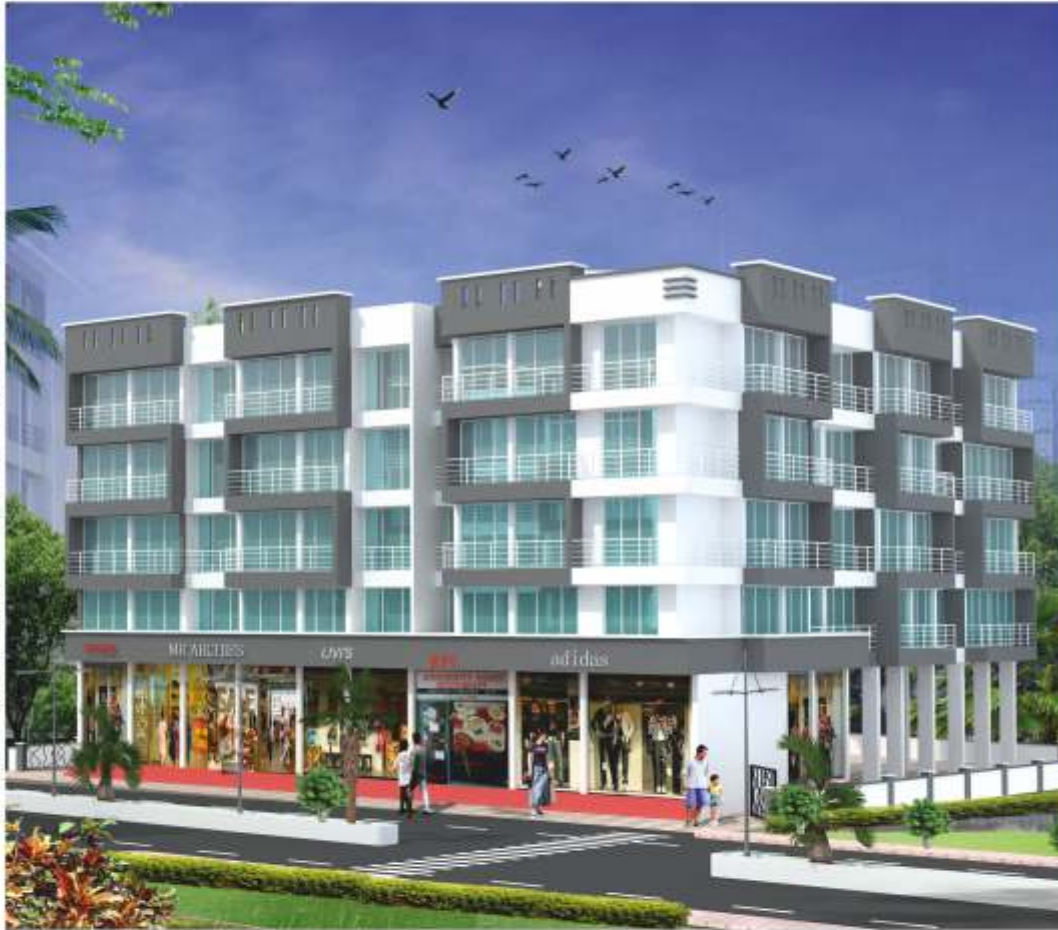
WING - A