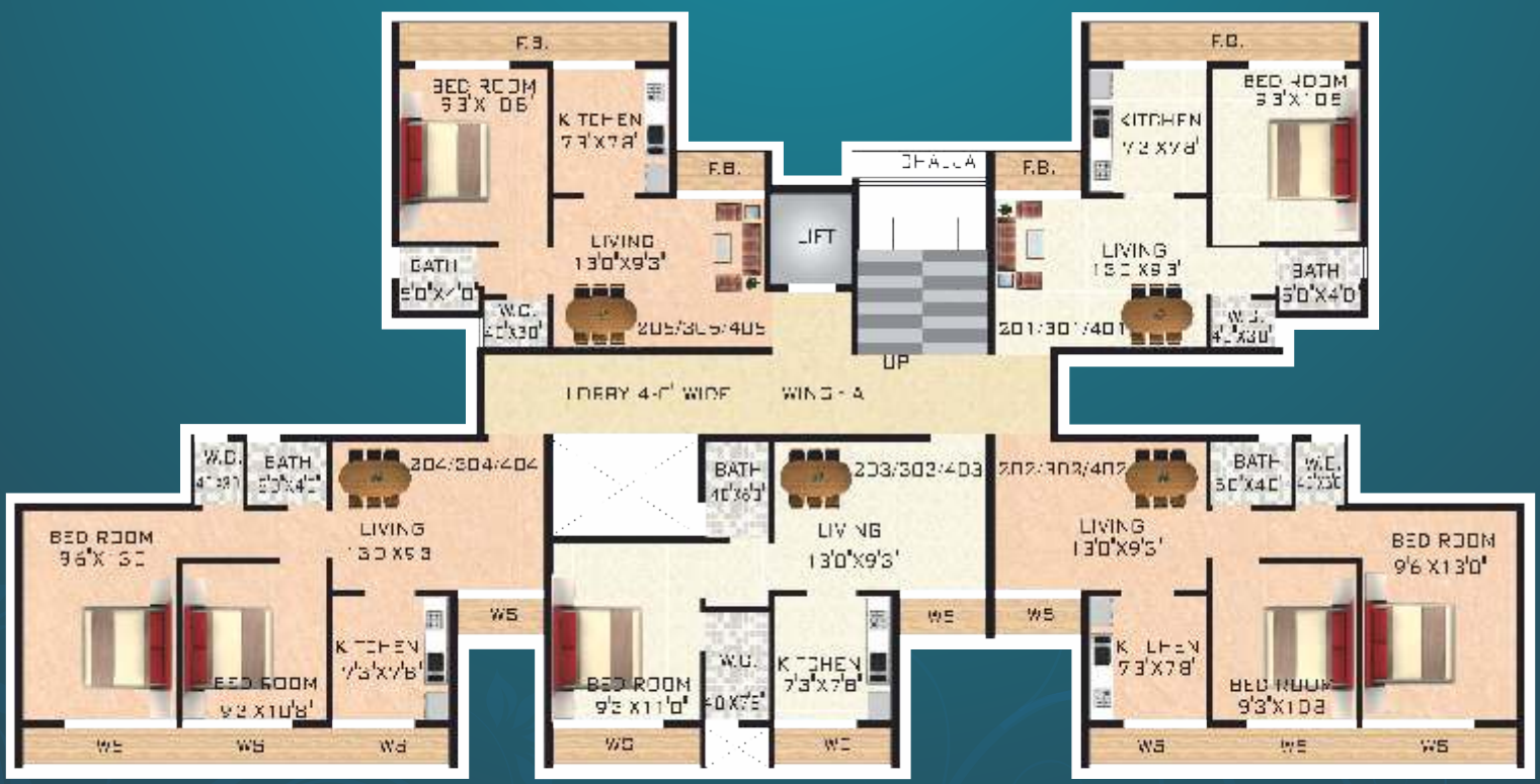
Typical Floor Plan Wing - A