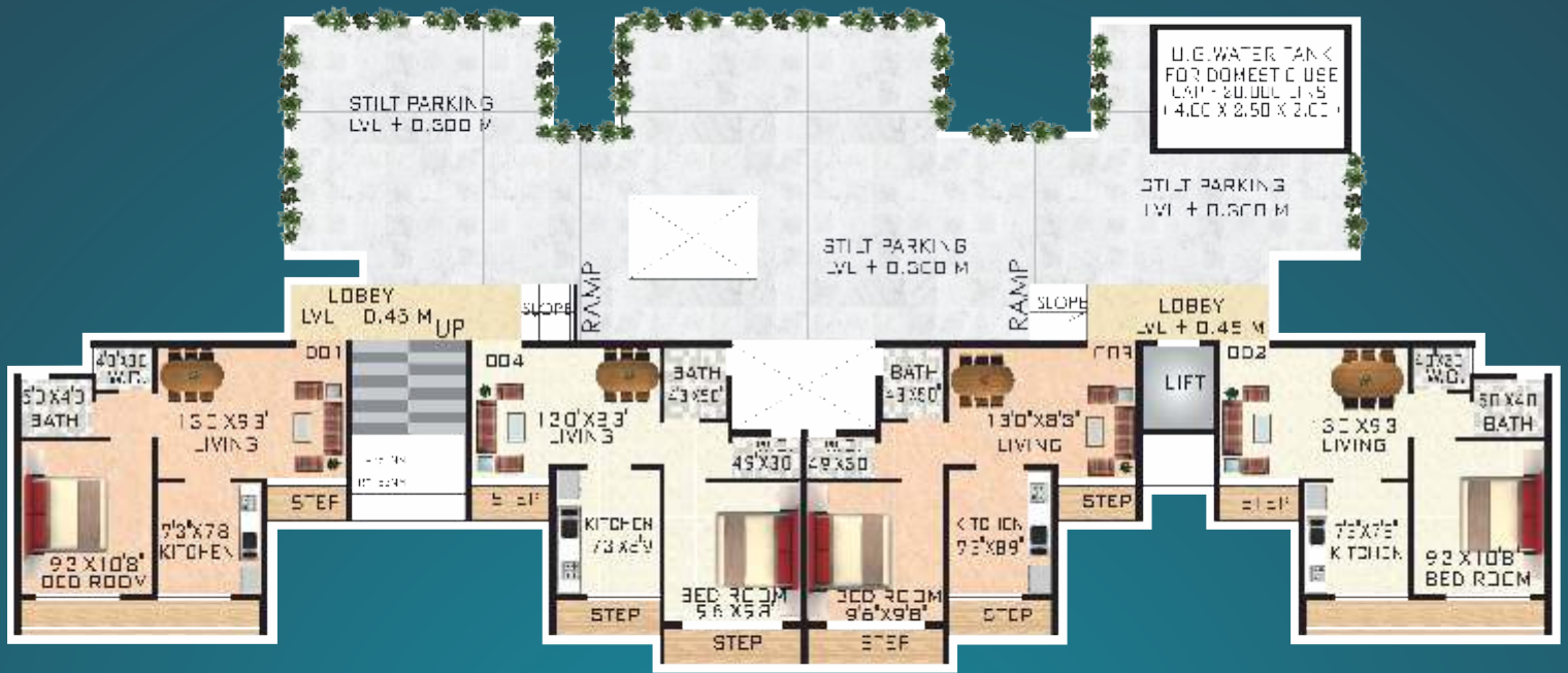
Ground Floor Plan Wing - B