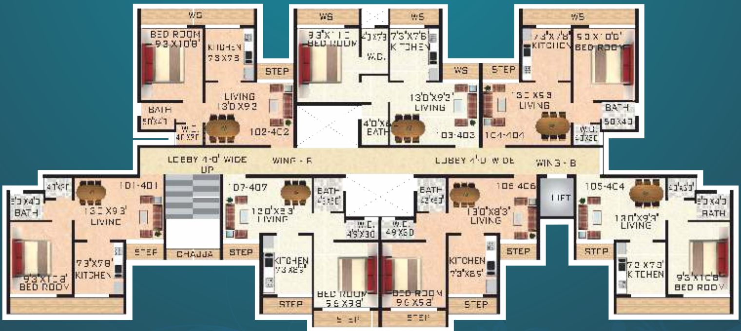
Typical Floor Plan Wing - B