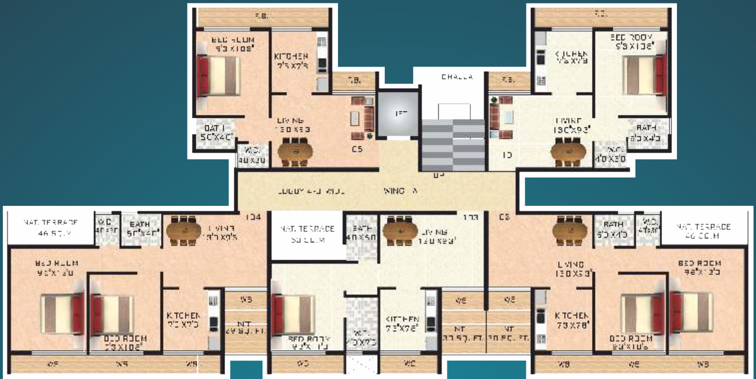
First Floor Plan Wing - A